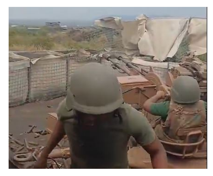
SANDF troops in action against M23 rebels in the DRC.

The chorus of calls for South Africa to properly resource its military and withdraw its troops from the Democratic Republic of Congo (DRC) continue after 13 SA National Defence Force (SANDF) soldiers were killed there over the last week.